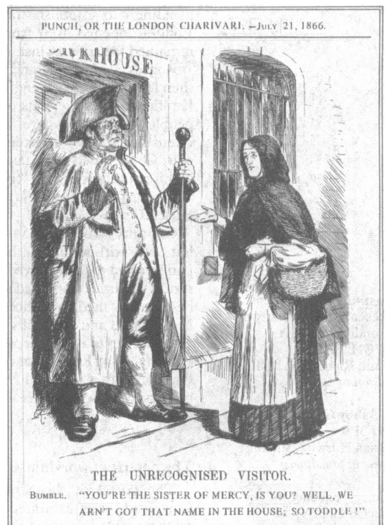
“Punch” cartoon depicting Bumbledom in 1866