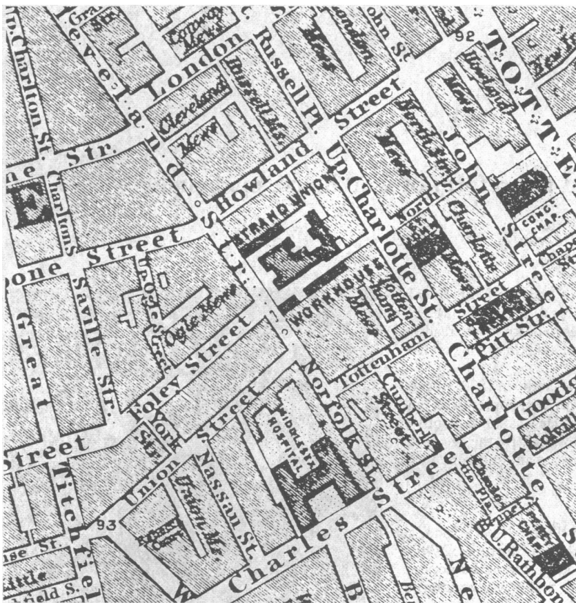
Map showing Strand Union Workhouse and Middlesex Hospital in 1862

accused of trying to save himself trouble. Some guardians pressed for the cab fares to be deducted from his salary. 13 19-22